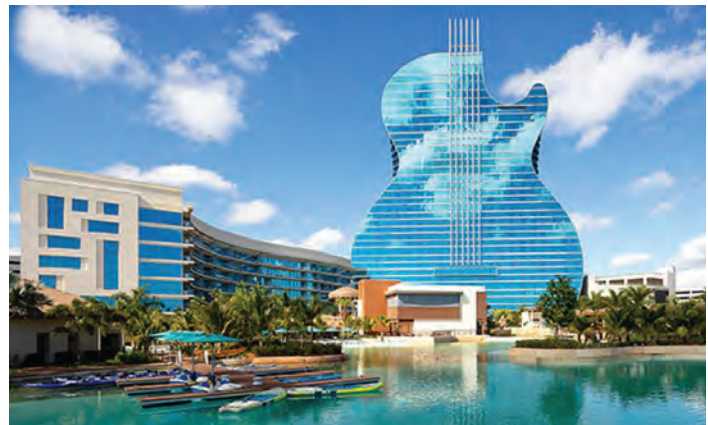
The Guitar Hotel at Seminole Hard Rock, Florida

When you're ready for the RAM Steel Advantage